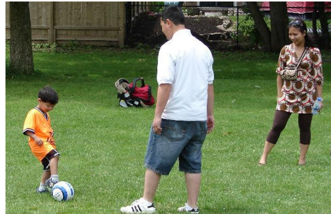
To Coordinate Activity