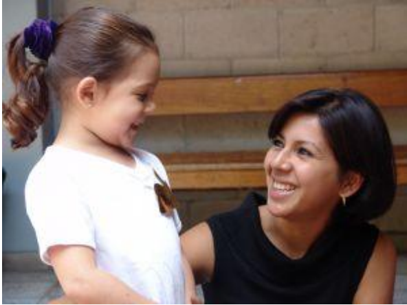
To Share Pleasure